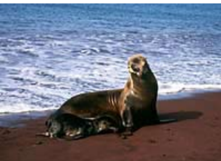
Galapagos islands, sea-lion and baby

Five young heritage professionals from around the world will receive UNESCO-VOCATIONS PATRIMOINE fellowships to pursue post graduate research at University College Dublin (Ireland) and at the Brandenburg Technical University of Cottbus (Germany).